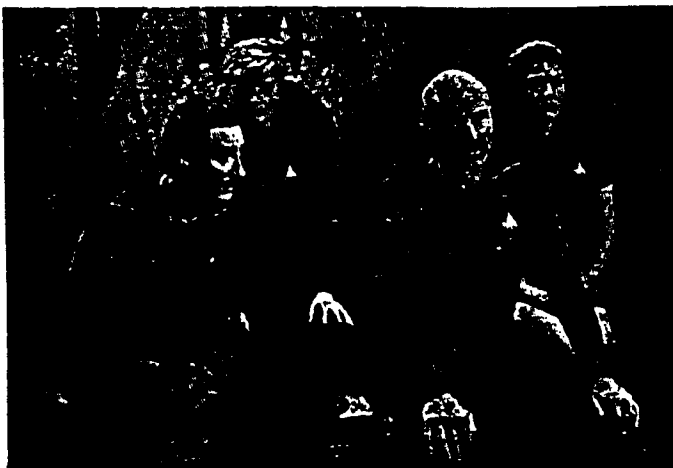
EXCUSE ME, CAPTAIN. ARE WE HAVING FUN YET?