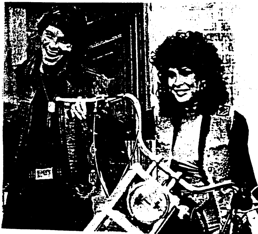
A VERY YOUNG JONATHAN FRAKES AS BARBARA EDEN'S BOYFRIEND IN "HARPER VALLEY P.T.A."

THE NEW RICHARD DREYFUS MOVIE "LET IT RIDE" FEAT- URES TWO ACTRESSES OF STAR TREK FAME: TERI GARR WHO PORTRAYED ROBERTA LINCOLN IN THE EPISODE "ASSIGNMENT EARTH" AND MICHELLE PHILLIPS, FORM- ERLY A SINGER WITH THE MAMAS AND THE PAPAS, WHO PLAYED JENICE MANHEIM IN THE NEXT GENERATION EPISODE "WE'LL ALWAYS HAVE PARIS". THE ACTRESS HERTA WARE, CAST AS PICARD'S MOTHER IN "WHERE NO ONE HAS GONE BEFORE" CAN BE SEEN IN THE MOVIE "PROMISED LAND".