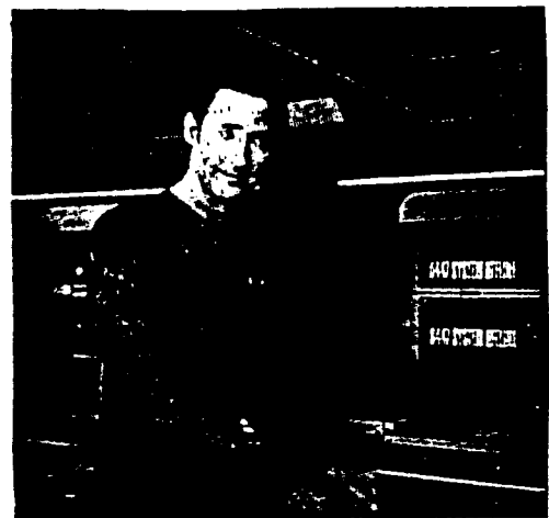
THIS, BOYS & GIRLS, IS THE SELF-DESTRUCT BUTTON... OOPS!

SO ENDS THE FIRST ISSUE OF THE KELLY COMMUNIQUE. I'VE HAD FUN AND I HOPE YOU ENJOY READING IT. LET ME KNOW WHAT YOU THINK! THE U.S.S. KELLY FAN CLUB IS A NOT-FOR-PROFIT ORGANIZATION, AND ANY INFRINGEMENT UPON THE LEGAL COPYRIGHT HOLDERS IS UNINTENTIONAL. UNTIL NEXT TIME, LIVE LONG AND PROSPER.